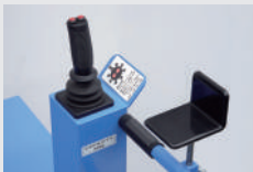
Joystick Controller for Moving and Up/Down

*Maintenance stopper to keep safety at checking and repairing under the table.