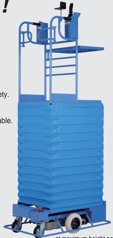
at maximum height position

Traveling Range: approx.6.8km, Up/Down: approx 85times (using new battery with full charge) *Depend on the battery's condition and working environment, the above number may differ.