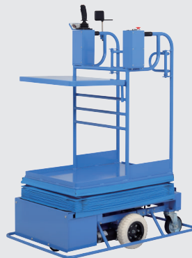
at minimum height position