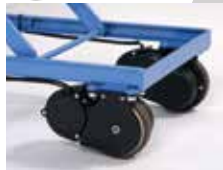
The high efficiency motor can be energy-saving and powerfully assisted