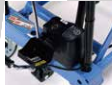
Simple and functional operation panel with the voice guidance