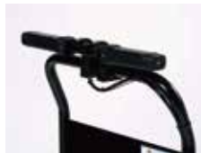
Grip the handle to activate the power assist function