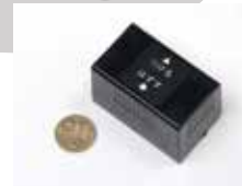
Re-chargeable Lithium-ion battery