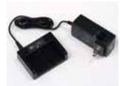
The spare battery and stationary charger can save charging time ※ Spare battery sold separately